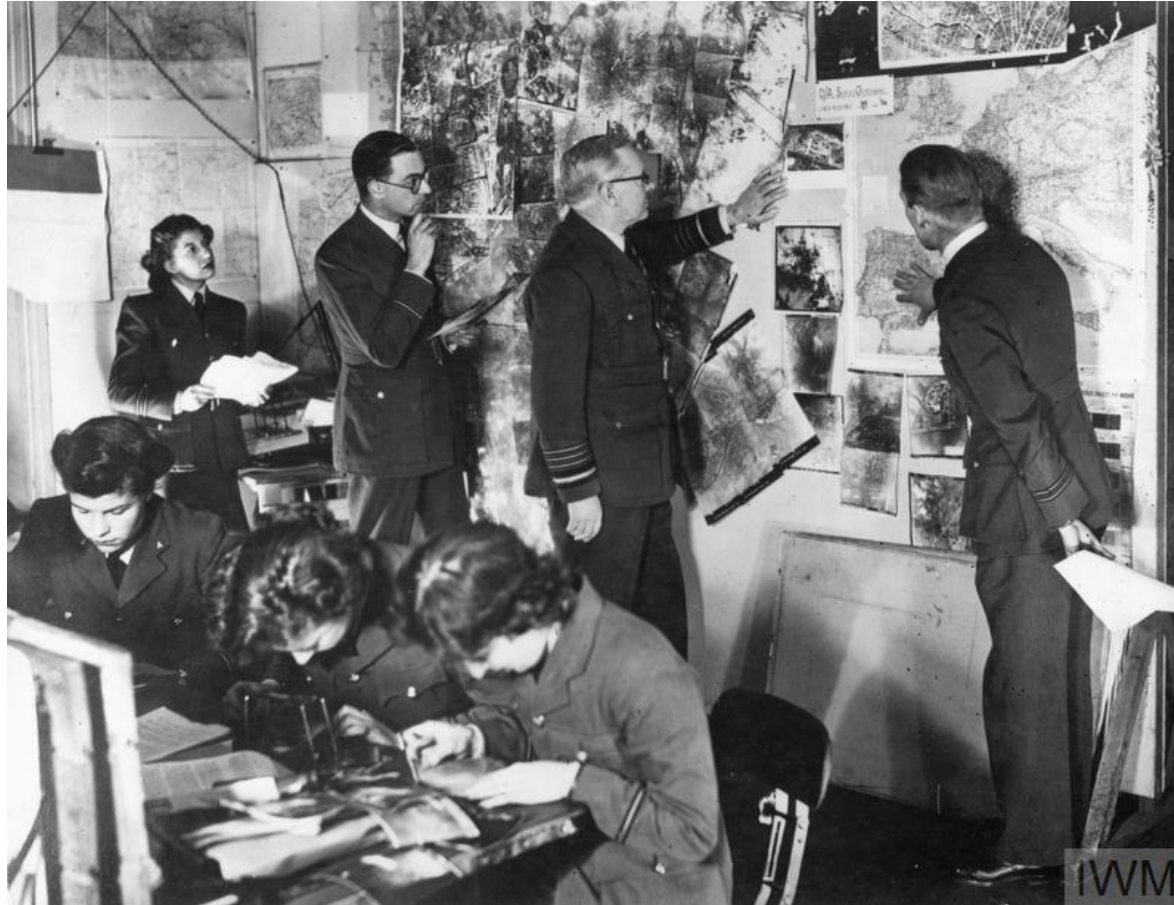
Air Chief Marshal Sir Arthur Harris, Air Officer Commanding-in-Chief Bomber Command, attended by photographic interpretation officers, studies aerial reconnaissance photographs of a recent raid in the Bombing Interpretation Room at Bomber Command Headquarters, High Wycombe, Buckinghamshire.